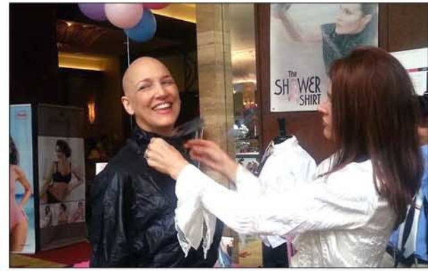
Day of Caring, Miami, Florida

The SHOWER SHIRT® Co., LLC Principle/Inventor